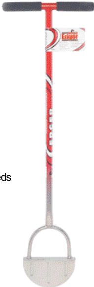
Item Code 17500 91704. 4 Pack Case.