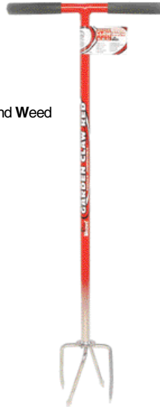
Item Code 17500 91314. 4 Pack Case.