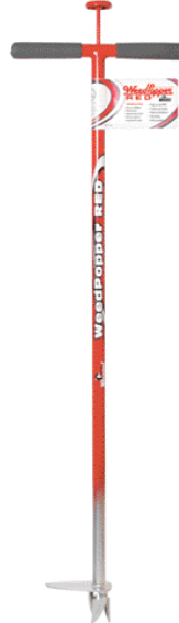
Item Code 17500 95026. 6 Pack Case.