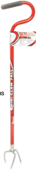
Item Code 17500 91326. 6 Pack Case.