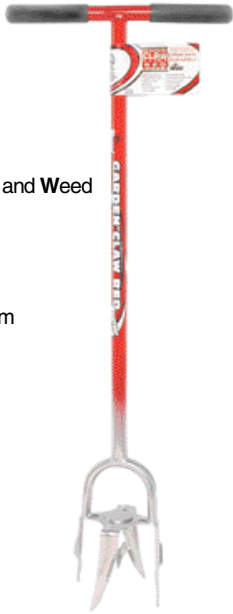
Item Code 17500 91344. 4 Pack Case.